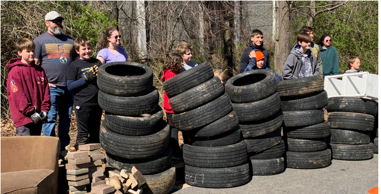
West End Rugby Team on Americana Drive – 👍 Liked by Legislators 👍

The cost for the handouts given to legislators' offices was approved for reimbursement.